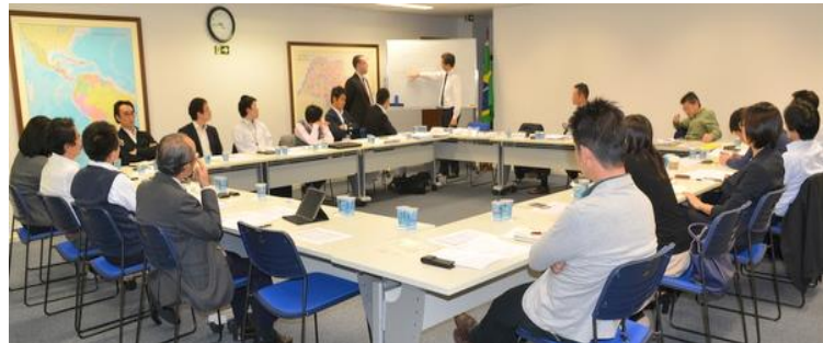
Active participation in Working Group Labor Working Group (Jun, 2017)