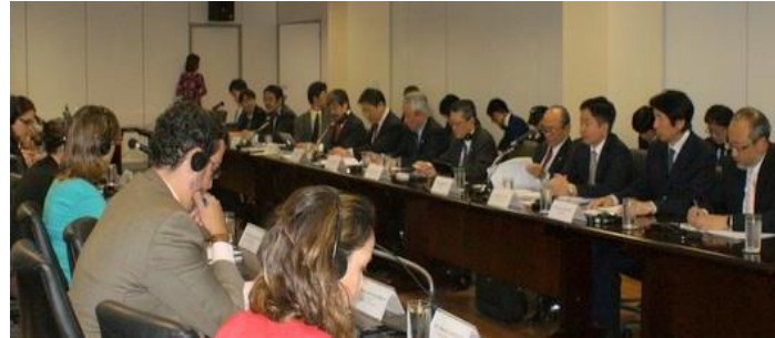
Joint Committee – Interim Meeting (2017/04/07)