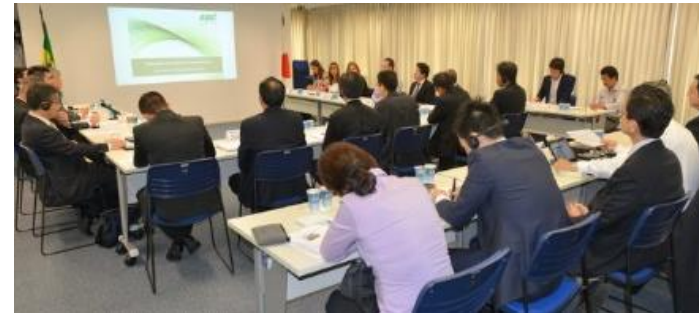
Study sessions in about foreign exchange risk (2017/06/12)